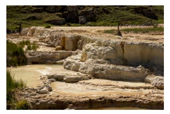
Active deposition at downstream end of the tufa terraces.

Drainage through the tip continues, so the tufa is still expanding, but it appears that it has all been deposited within about 150 years. This rapid deposition of carbonate from alkaline solutions accounts for the calcite straw stalactites that are commonly seen inside brick tunnels or wet basements, where the source is the lime in mortar, cement or concrete. Less than two kilometres from Harpur Hill, Poole's Cavern is famed for its stalagmites, some of which stand more than ten centimetres tall on top of pipes that were installed for Victorian gas lighting. Unlike the other, very much