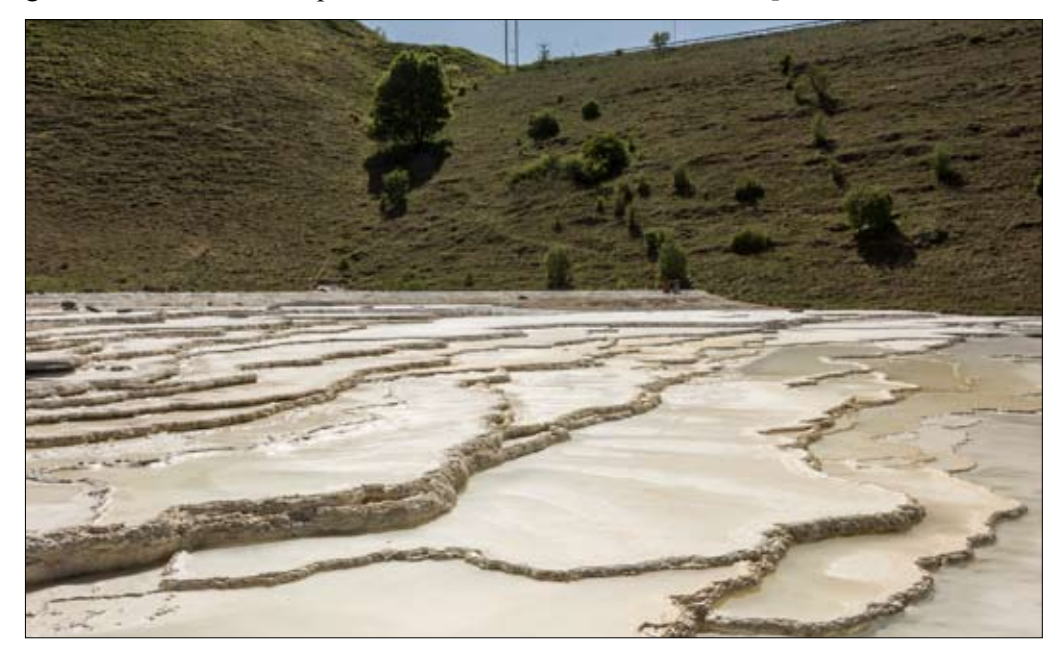
Upper end of the tufa terraces of Harpur Hill; the grass slopes behind are natural on the left, and are the front slope of the lime waste tip on the right.

Lime burning was a very inefficient process within the simple lime kilns of past centuries, and it produced huge amounts of waste. This consisted of a rubbly mixture of partially calcined limestone, glassy clinker, lime and coal ash, and it was simply dumped on the hillsides in large quantities. Groundwater draining though this lime rubble directly dissolves the reactive calcium oxide, thereby producing calcium and hydroxyl ions in hyperalkaline solutions (with pH of 9 to 13). When these waters emerge into open air, they absorb atmospheric carbon dioxide, to cause precipitation of calcium carbonate. The end result is the same as from deposition by natural limestone waters, except that the role of carbon dioxide is reversed in the final precipitation. Most importantly, this precipitation of calcite can take place at rates around 100 times faster than that caused by loss of carbon dioxide that prompts deposition from bicarbonate in solution.