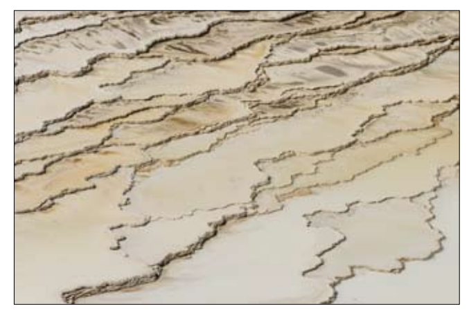
Endless patterns within the terracettes that are each a few centimetres high on the tufa

At Harpur Hill the great lime works with its row of kilns was active between 1835 and 1952. During that time, thousands of tonnes of waste were dumped on tips that extended out towards the Brook Bottom valley. Tramways were laid across the flat top to the sites for end-tipping. The whole flat area is now occupied by the industrial estate, which also extends eastwards onto the backfilled quarry floors behind the sites of the longdemolished kilns. The tips reached the streambed along the valley floor around 1890, and most of the tipping was during the subsequent thirty years or so, with the stream from the natural spring flowing through a brickbuilt culvert that was eventually buried. Rainwater drains through the tip to seep out at the foot of the slope or leak into the culvert, and from either route deposits the tufa soon after emerging into daylight.