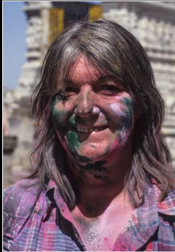
Festival of Holi, with powder paints, in Jaipur