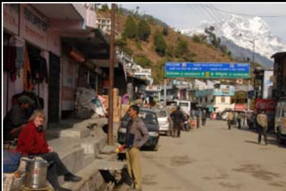
On the road to Kedarnath