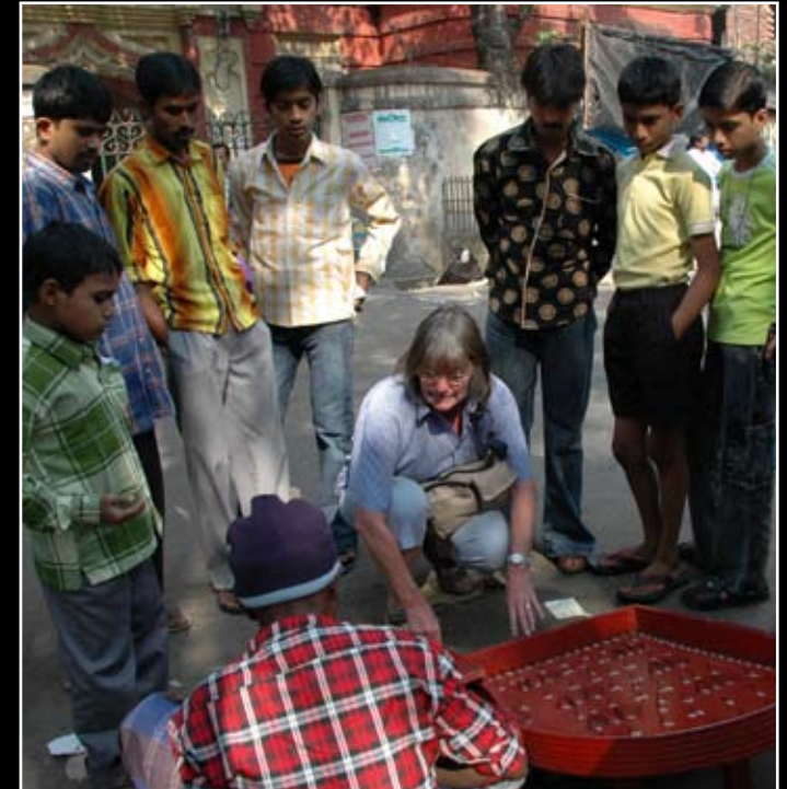
Not winning at street bagatelle in Calcutta