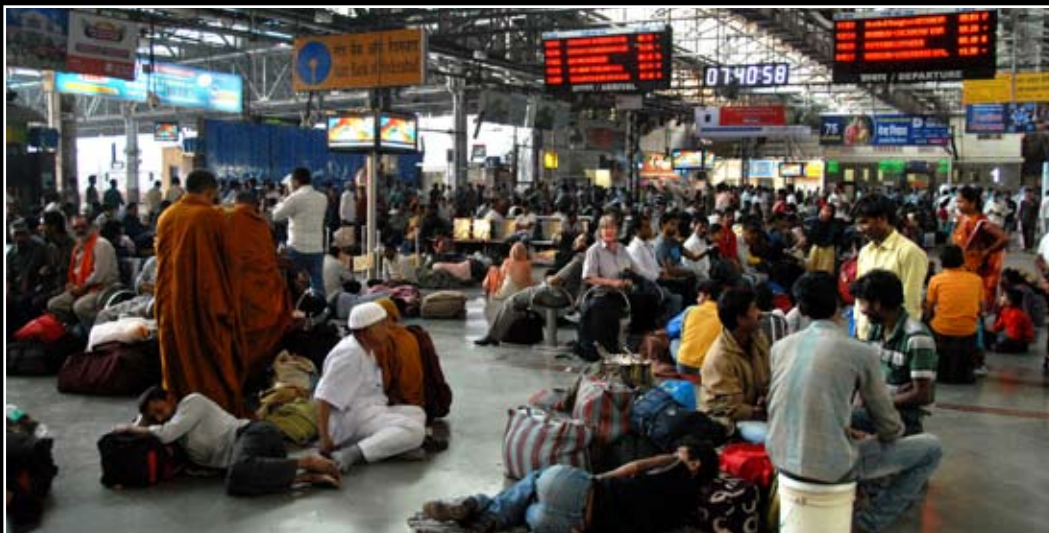
Waiting for the train at Howrah, Calcutta