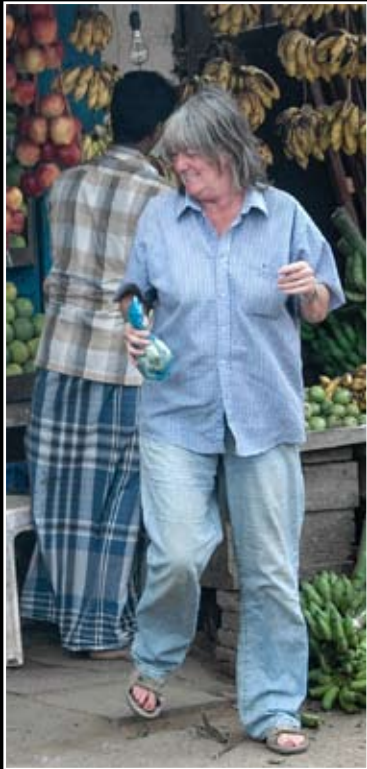
Green oranges at Chidambaram