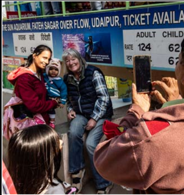
Yet another photo-call, at Udaipur