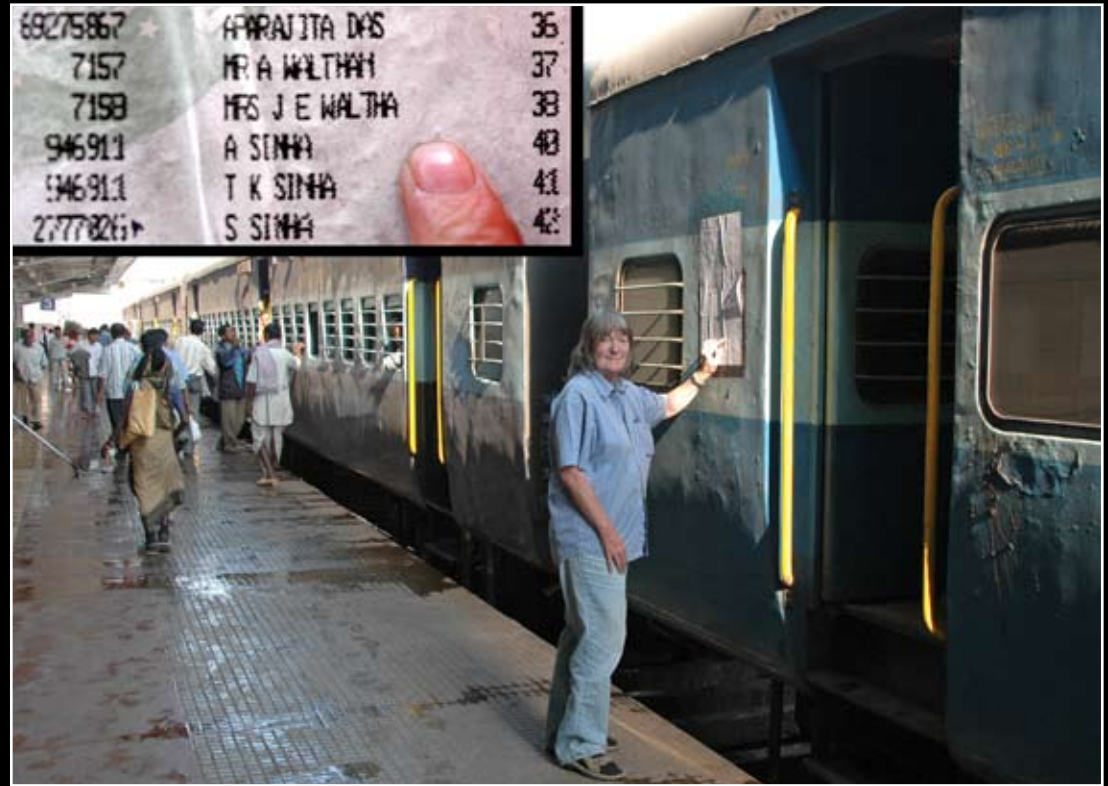
Sleeping car reservation pasted onto overnight train from Calcutta to Hyderabad Having the handbag repaired on a side street in Trivandrum