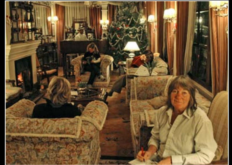
Christmas in the Elgin Hotel, Darjeeling