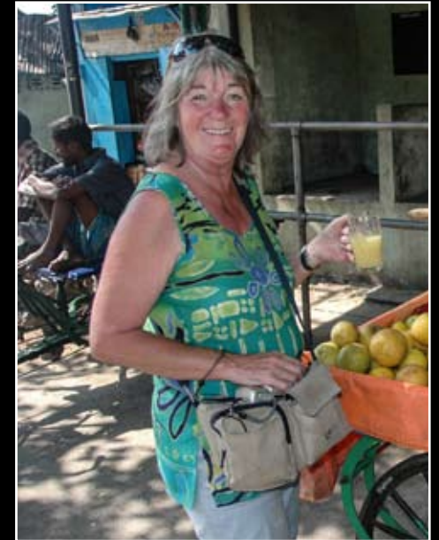
Oranges at Tanjore