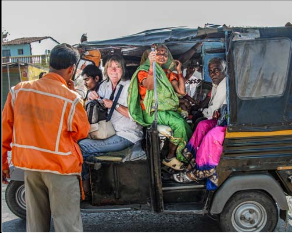
Crowded local transport at Jabalpur