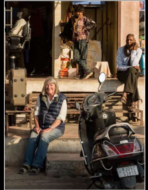
Rest time in Chittorgarh Christmas at Sigiriya, Sri Lanka