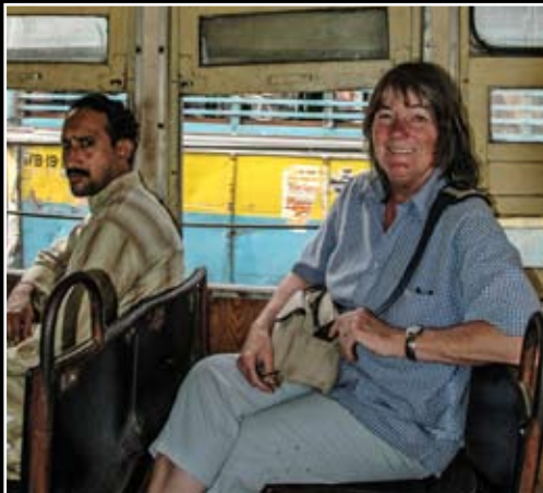
City bus in Calcutta