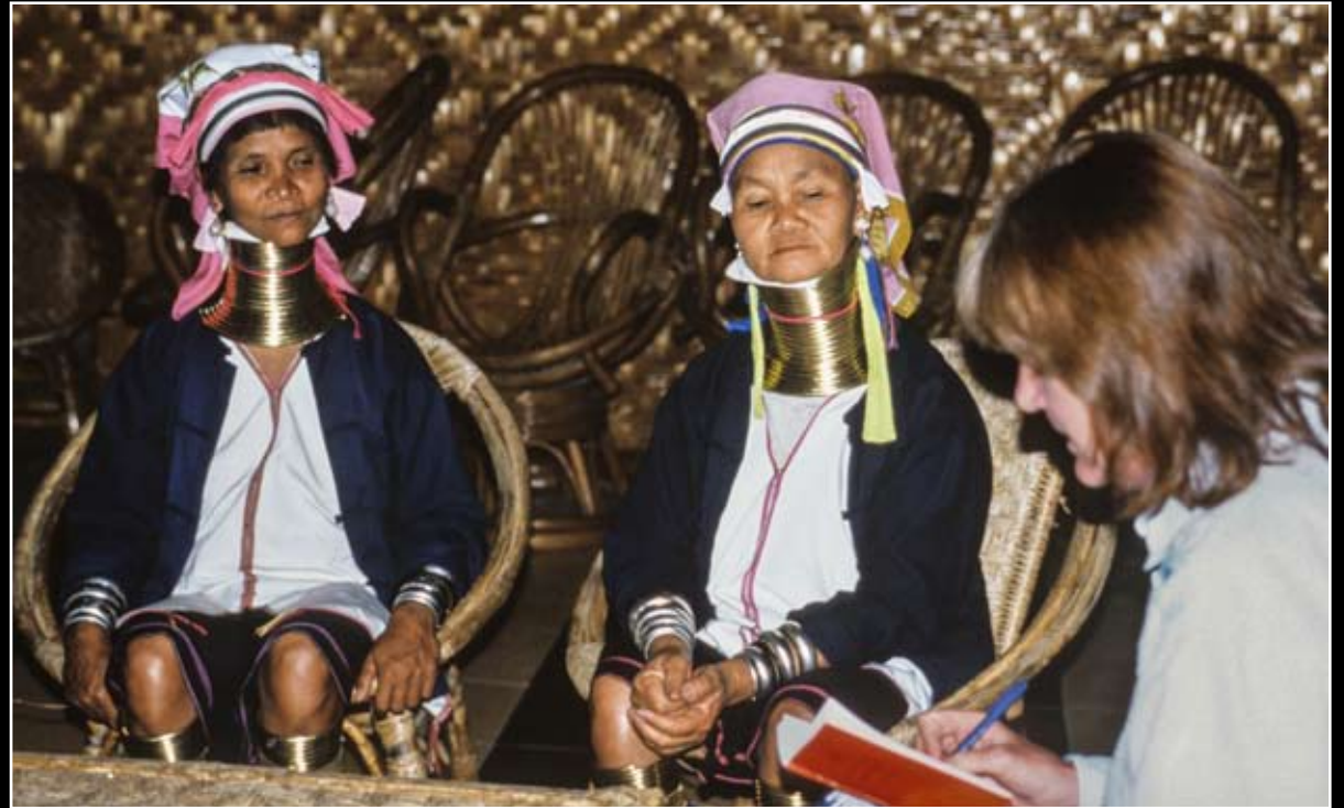
Interview with Padaung "giraffe-neck" ladies, Nyaungshwe, Myanmar (Burma) Children working at brickyard, Mandalay, Myanmar Two more bus rides