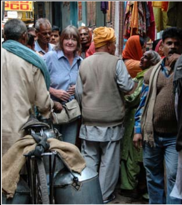
Main street in the old city of Varanasi