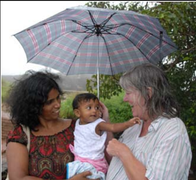
Sheltering from the heavy rain on top of Sigiraya (Lion Rock), Sri Lanka