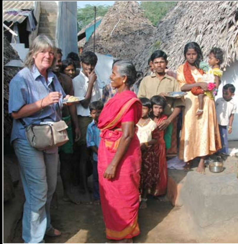
Giving rice to passers-by during Pongal festival, Chettinad Zaskar River beside mountain road from Manali to Leh