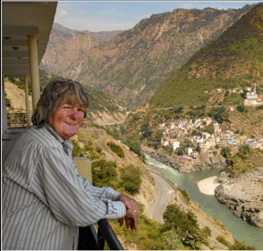
Devaprayag, confluence of rivers to form the Ganges Taglang La, 5328m high across the Himalayas