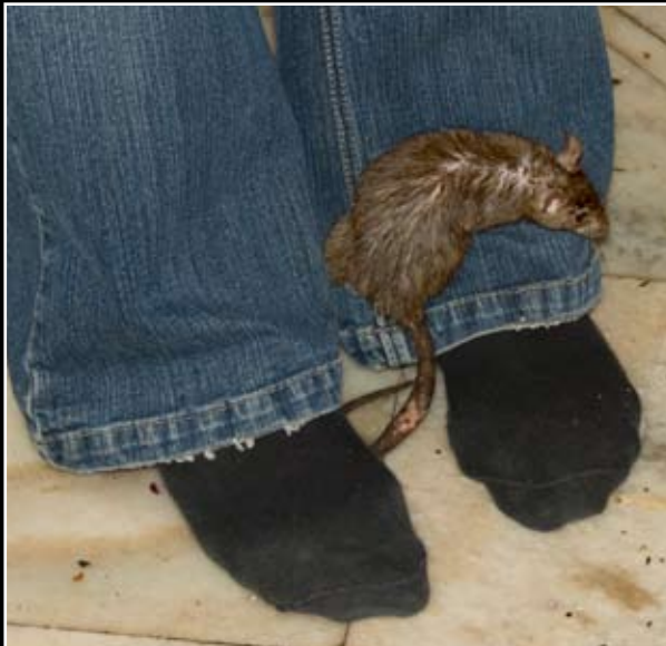
Karni Mata rat temple, Bikaner