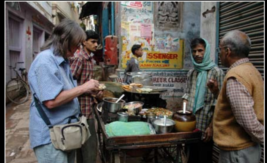
Breakfast in the back streets of Varanasi