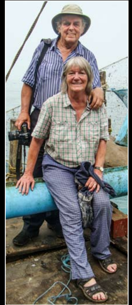
Together at Kochi Bananas at Madurai