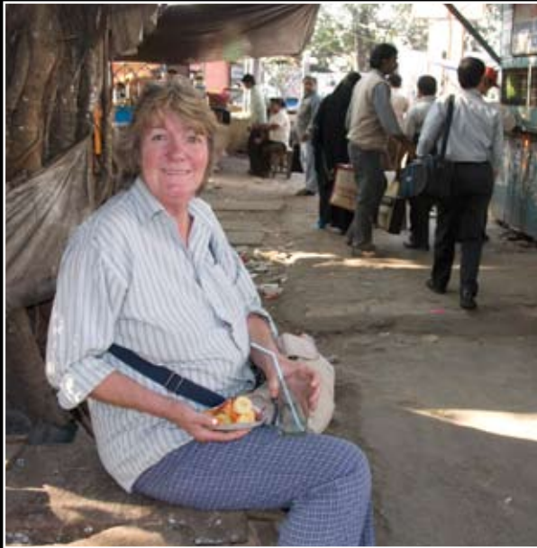
Fruit lunch in Calcutta