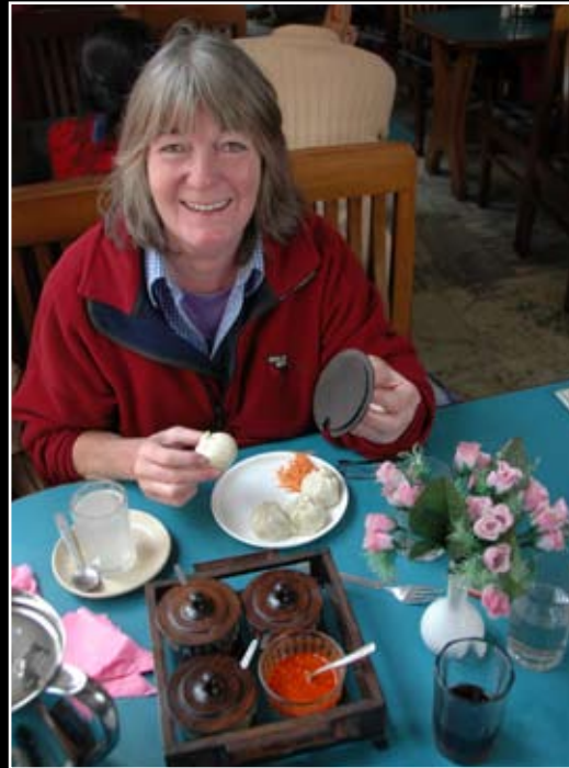
Waiting for a bus from Darjeeling to Gangtok