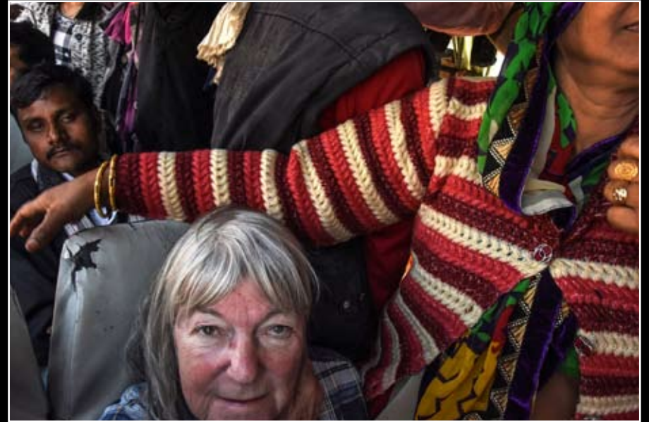
Crowded bus ride to Abhaneri, to see the amazing stepwell