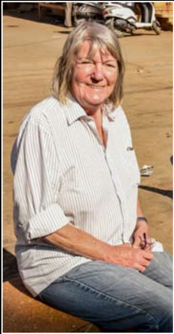
Winter sunshine at Jaisalmer