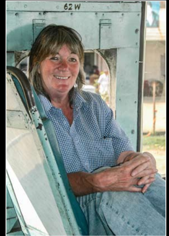
On the bus to Pondicherry