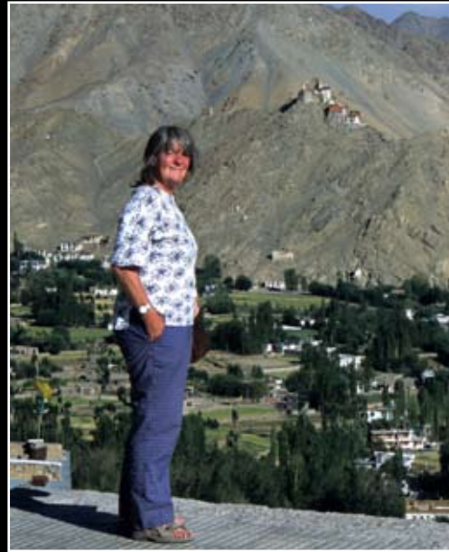
Above Leh, capital of Ladakh