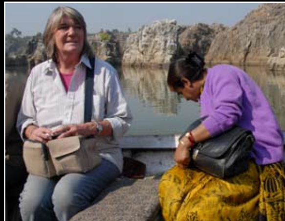
Boat ride near Jabalpur