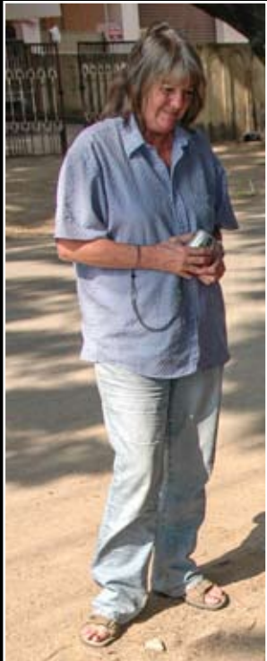
Varanasi and River Ganges, and Taj Mahal